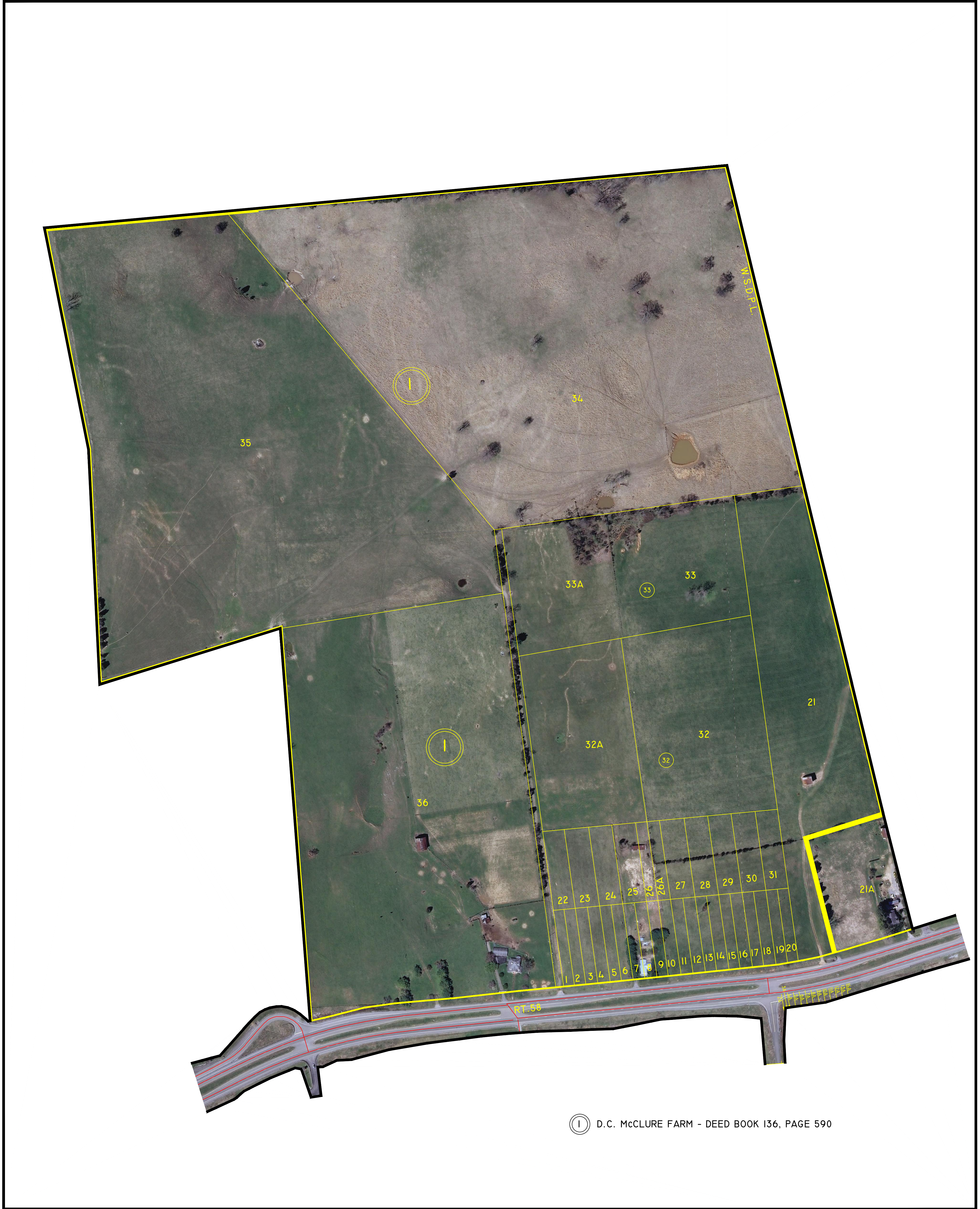
① D.C. McCLURE FARM - DEED BOOK 136, PAGE 590